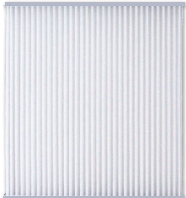
New Cabin Air Filter takes less than 15 minutes to install and has a 12,000 to 15,000-mile recommended change interval.