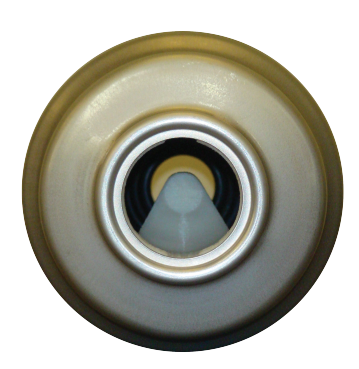
Bottom view of LFF6012