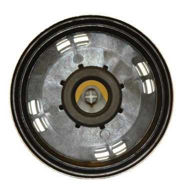
Top view of LFF6012.

Engine and equipment manufacturer's warranties remain in effect when Luber-finer filters are used.