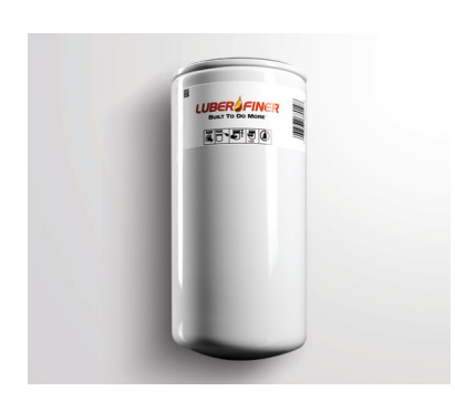
Product isolated and presented individually.