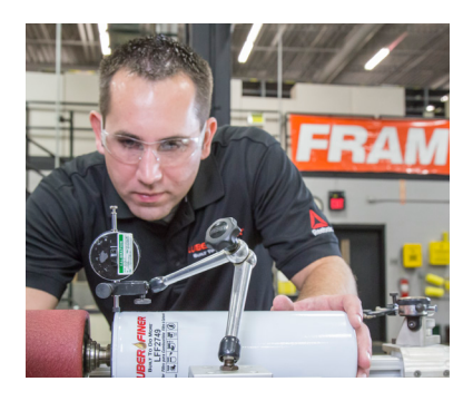
A shot of Luber-finer®'s strict product testing.