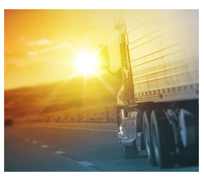
Application photography showing environmental conditions focuses on the open road.