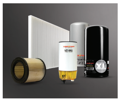
Product array arranged in a dynamic format.