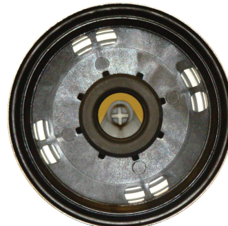
Top view of LFF6012.

Engine and equipment manufacturer's warranties remain in effect when Luber-finer filters are used.