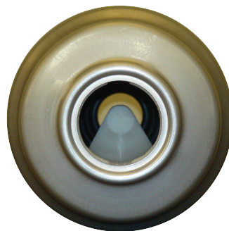
Bottom view of LFF6012